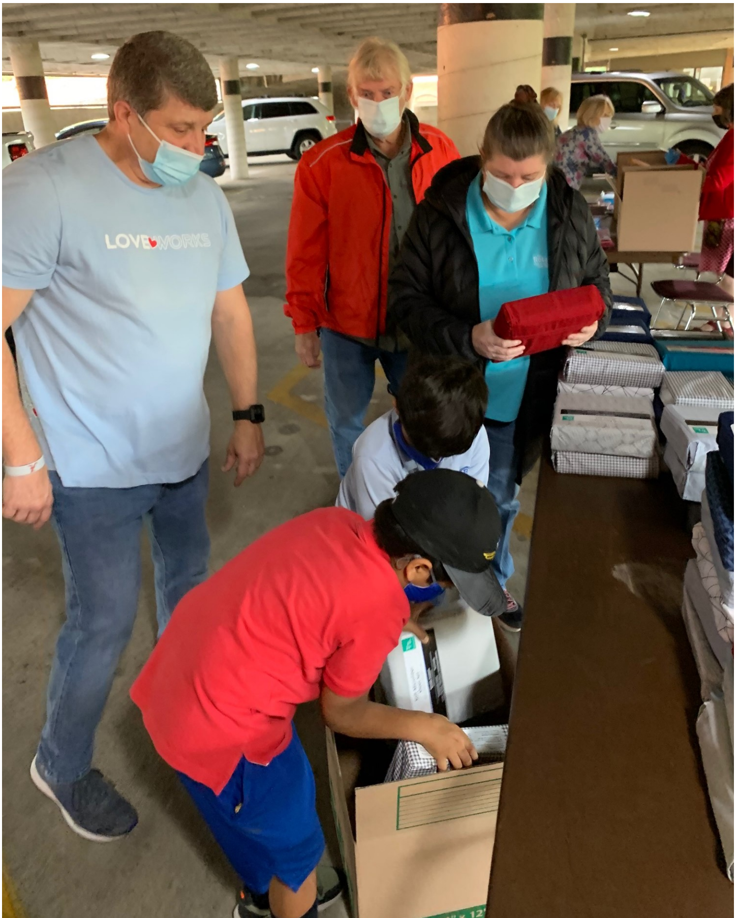
In September, Rotarians from Columbus, North Columbus, Muscogee and Rotaract Clubs met enthusiastically and safely at the Trade Center Parking garage, to carry out our collaborative club service